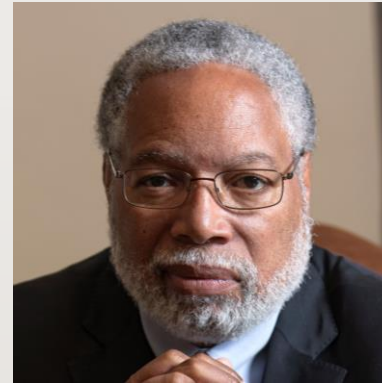
Lonnie G. Bunch III

Sterling Professor of History and Director, Gilder Lehrman Center for the Study of Slavery, Resistance, and Abolition, Yale University